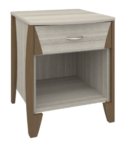
Model: LBNS10 21.25W 19.25D 25H

Refreshing as the sea air its name represents, the streamlined Long Beach Collection's dual-toned look is the perfect match for any décor. Long Beach features chamfered side frames and front overlay design; extended tops provide additional space. The distinctive leg design has stylish dimensional appeal.